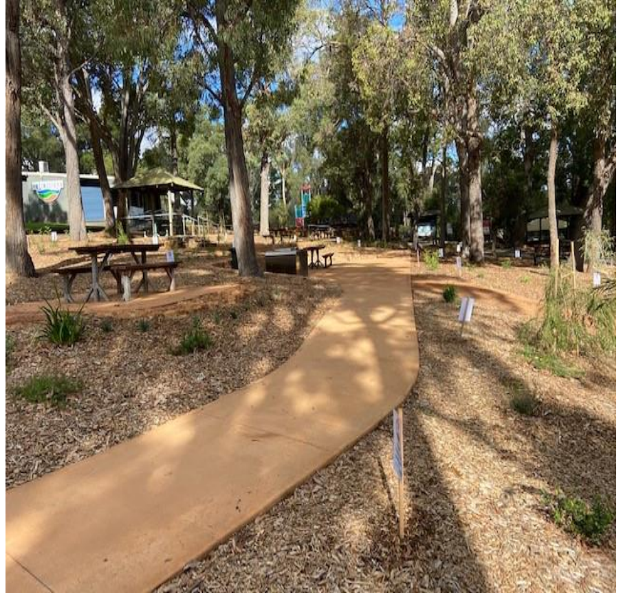
Shire of Mundaring – Lake Leschenaultia Facilities Upgrade – BBRF Round 4

All projects must be investment ready , to allow construction to commence within 12 weeks of executing a grant agreement with the Commonwealth.