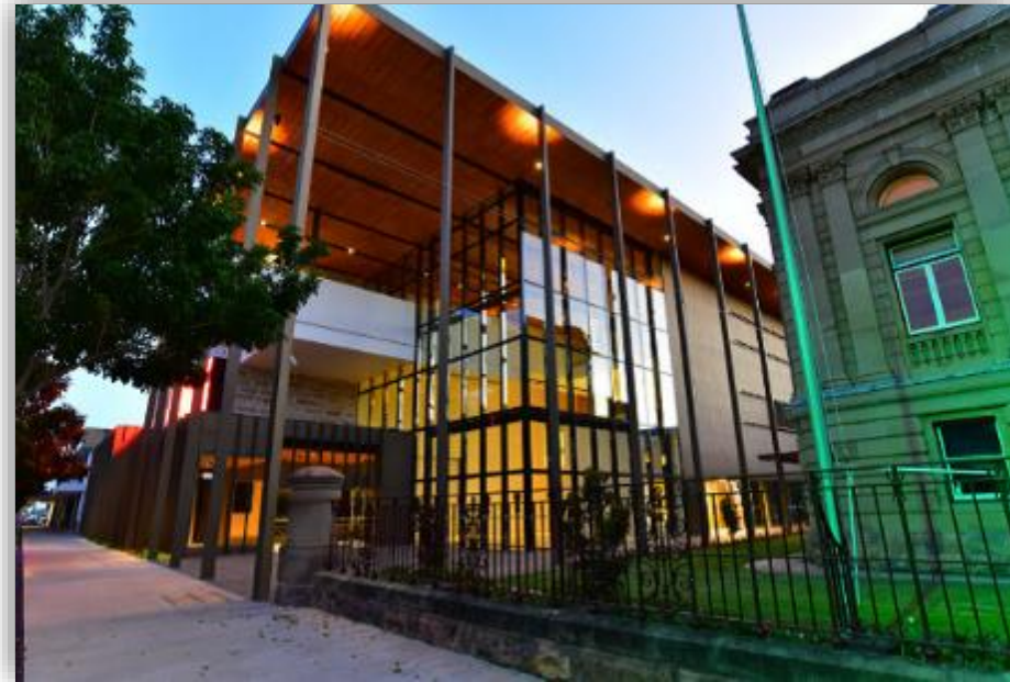
Rockhampton Regional Council – New Rockhampton Art Gallery – BBRF Round 3

The projects must be completed by 31 December 2024.