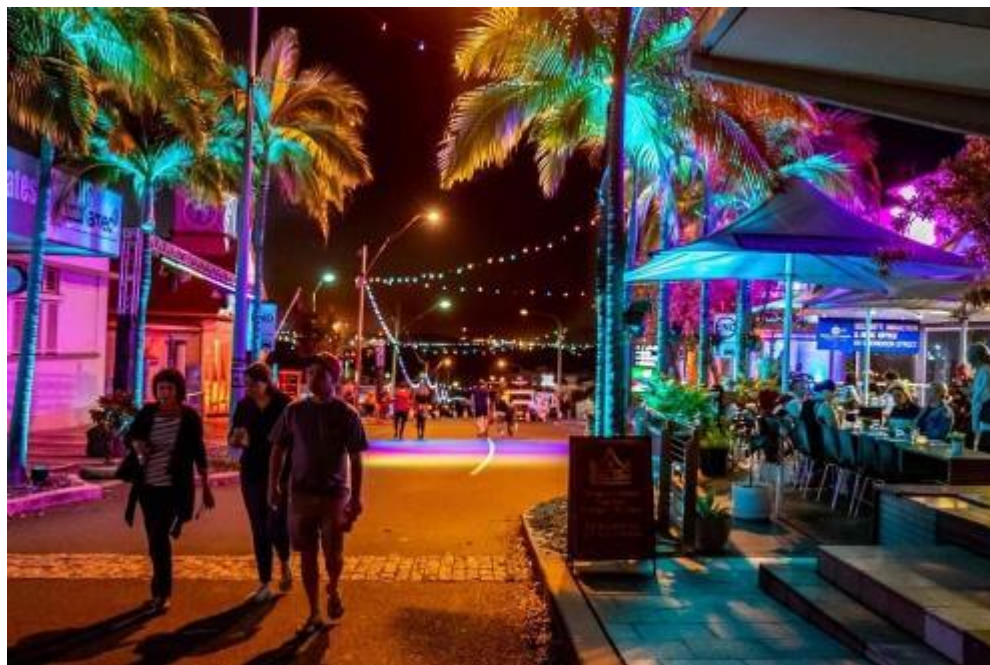
Gladstone Regional Council – Luminous 2021 Heritage - BBRF Round 4

Applicants can only spend grant and co-funding on eligible activities directly related to their project.